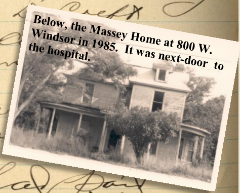
Below, the Massey Home at 800 W. Windsor in 1985. It was next-door to the hospital.