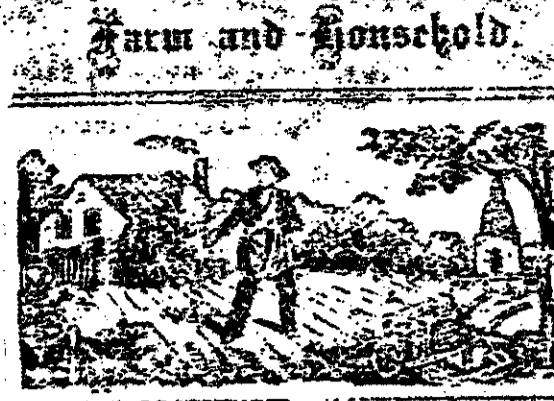
The Stock Law, as Viewed by a Progressive Mecklenburg Farmer.

Editors CHARLOTTE OBSERVER: In your issue of Wednesday a correspondent from Winnsboro, S. C., makes inquiries concerning the working and popularity of the stock law in Mecklenburg county.